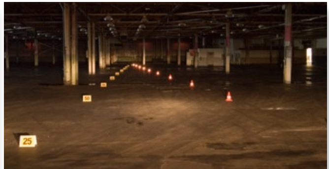
The Competition — high beam