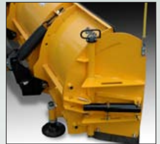
Each wing can be positioned independently.

Multi-Position Wings greatly improve the performance and efficiency of your Lot Pro moldboard. Each wing can be positioned independently to create a box, scoop or straight blade configuration (up to nine positions) with the pull of one pin.