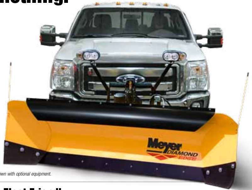
Shown with optional equipment.

The Meyer Diamond Edge can also be attached using the time-tested EZ-Mount® Classic™ mounting system.