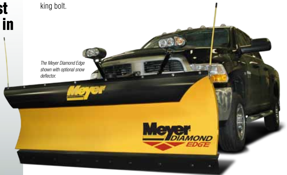
The Meyer Diamond Edge shown with optional snow deflector.

Meyer Diamond Edge plows come standard with a reversible center hole punched cutting edge for longer wear life.