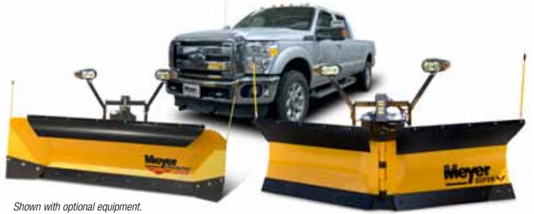
Shown with optional equipment.

The EZ-Mount Plus mounting system is Fleet Friendly because the moldboards and controllers are interchangeable.