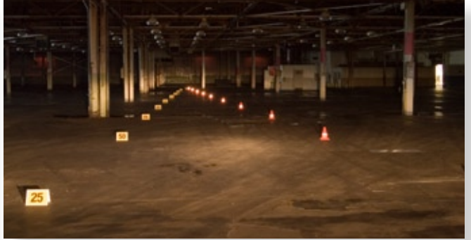
The Competition — high beam