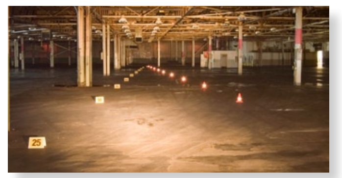
Nite Saber II — high beam

Unretouched images showing the difference in light output of Nite Saber II's versus the nearest competitor.