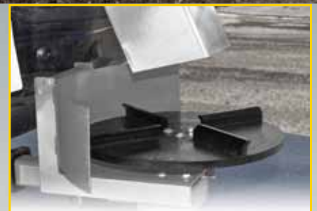
The spinner assembly fits into a 2" receiver mount and is quickly secured with one locking pin.

The Replaceable Tailgate Spreader from Meyer lets you turn your Payload™ insert dump body into a high performance spreader. Simply replace your Payload tailgate with the spreader tailgate utilizing the four existing locking pins, add the spinner assembly to your receiver hitch and you're ready to spread a wide variety of snow and ice control material.