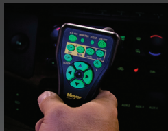
Pistol Grip Controller

Super-V LD is designed to fit 1/2 ton pick-ups. This smaller 7.5' blade design provides the same great performance of a larger V-plow, but allows users to plow in tighter areas such as driveways, condos or small parking lots. The aggressive attack angle provides incredible plowing performance, while each blade can be controlled independently with the touch of one button.