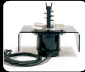
The largest and toughest motor in the industry.

The Meyer® Blaster™ spreader features a 1/2 hp direct drive motor that gives you the auger power when and where you need it. The Blaster motor and controller deliver a continuous 40 amperes during normal operation and surges to 70 amperes when the "blast" feature is pressed to grind through rock salt, calcium chloride and other ice melting materials. The low maintenance polyethylene hopper and 304 stainless steel spinner are built to provide years of service. ROC 3/5 year warranty is available.