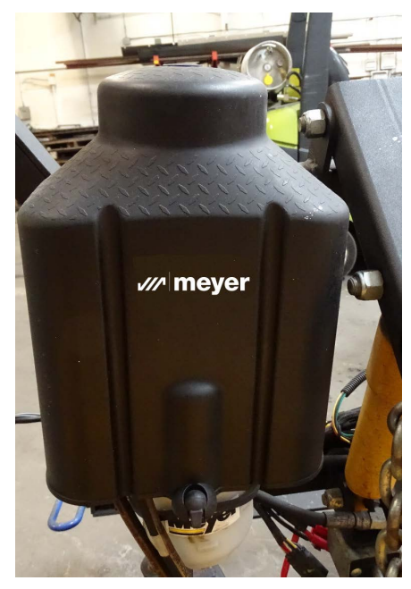
Step 8: To install the SOS vehicle harness (9) route the 12 pin connector (1) into vehicle's cab and plug into controller. Route the 16 pin connector (2) to the front of the vehicle and plug into the plow side harness. Route the 4 pin connector (4) to rear of vehicle and plug into vehicle's trailer harness using the trailer adapter harness (8) (50). Use cable ties to ensure the harness is secured to the vehicle's frame. The WHITE wire (5) will connect to 2015 & Later GM vehicles with alternator relay. See Meyer Products Service Bulletin SB252. The PURPLE wire will connect to the 2015 & Later Ram vehicle snow plow lighting enable wire under the fuse panel.