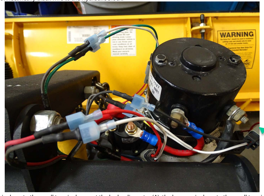
Step 6: Connect White wire loop to the small terminal nearest the hydraulic motor (A), the brown wire loop to the small terminal farthest from the hydraulic motor (B). Connect the heavy red wire to the large terminal of the motor solenoid (C).