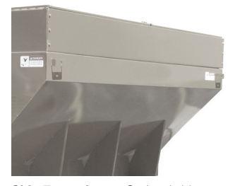
Side Extensions – Optional side extensions quickly increase hopper capacity.

*All gas models are standard with wireless control. Wireless control is not available with dual motor electric or hydraulic models. Dual electric is hardwired only.