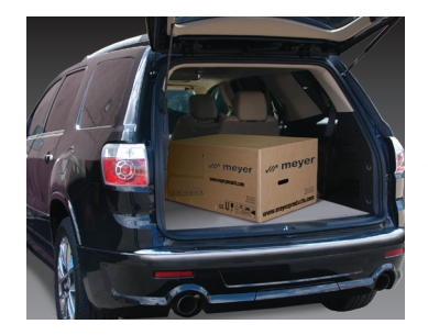
The Path Pro 2 comes ready to assemble in an easy-to-transport carton.