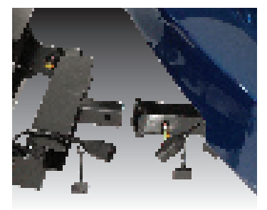
The Quick-Link™ mounting system allows you to attach the plow in less than one minute to the front of your vehicle using a Class 3, 5cm front receiver hitch.