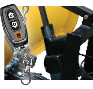
Electric Lift with wireless controller For up/down blade motion. Model #23275